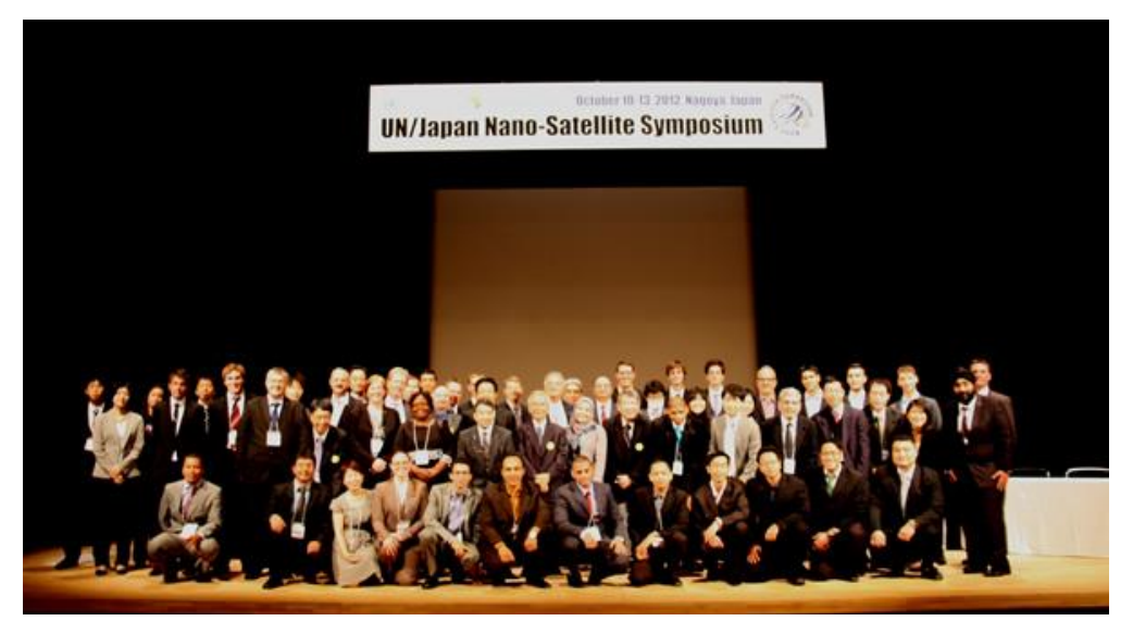
Fig. 1 Finalists, Semi-finalists, Reviewers, Coordinators, Supporters of MIC2

Nano-satellite technology development first started as either an educational or research tool primarily in universities and has spread rapidly across the world and found many practical applications. [1] Although micro/nano satellites cannot perform the same level of work as complex spacecraft because of limited power and room, there are many missions that can be made with micro/nano satellites. In order to facilitate the exploration of novel mission ideas using nano satellites, the Mission Idea Contest (MIC) was established in 2010. MIC has provided aerospace engineers, college students, consultants, scientists and anybody interested in space with opportunities to present their creative ideas and gain attention internationally. The team who initiated the contest intended to stimulate as many people as possible around the world to consider the potential applications for nano-satellites in the belief that nano-satellites will open a door to a new facet of space exploration and exploitation.[1] Fig.1 shows a group photo taken at the final presentation in the occasion of UN/Japan Nano-Satellite Symposium held in Nagoya, on October 10, 2012.